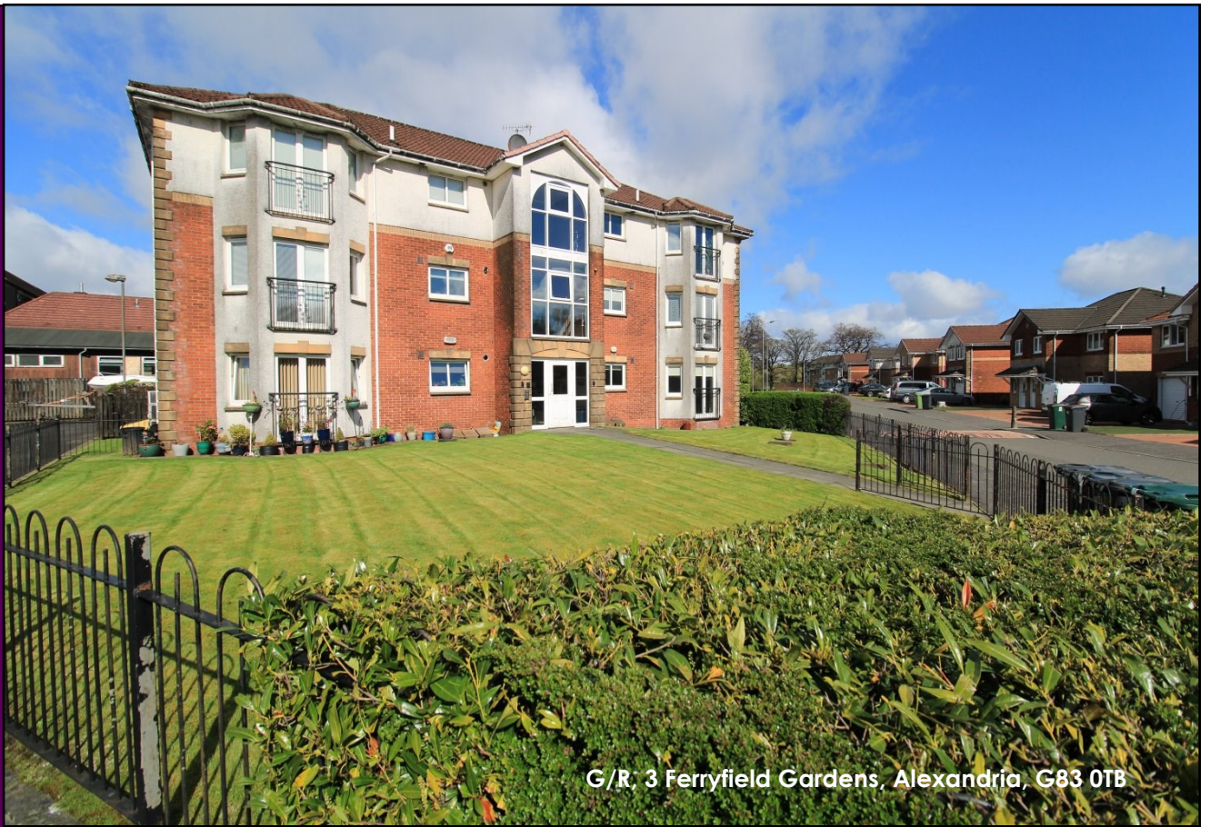
G/R, 3 Ferryfield Gardens, Alexandria, G83 0TB

Modern Turnberry built 2 bedroom ground floor flat. Gas-fired central heating and sealed unit double glazing. Door entry security. Well maintained communal gardens and entrance foyer/stairs.